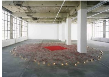
AdK_Hatoum_Undercurrent Undercurrent (red) , 2008 Stoffbezogenes Kabel, Glühbirnen, Dimsteuerung, 8 x 1070 x 1070 cm © Mona Hatoum