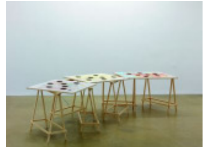
AdK_Hatoum_Cities 3-D Cities, 2008-2010 Stadtpläne, gedruckt, Holz, versch. Maße (ca. 78 x 362 x 180 cm) © Mona Hatoum