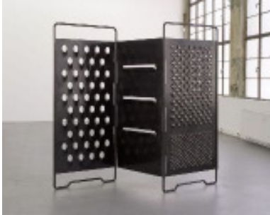
AdK_Hatoum_Paravent Paravent , 2008 Schwarz brüniertes Stahl, 302 x 211 x 5 cm © Mona Hatoum

Kostenfreie Verwendung ausschließlich für die aktuelle Berichterstattung im Kontext der Ausstellung und unter Nennung des Copyrights. Pressefotos auf Anfrage unter 030 200 57-15 14 oder presse@adk.de