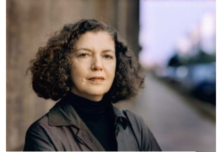
AdK_Hatoum_Portraet Mona Hatoum Fotograf Jim Rakete © Mona Hatoum