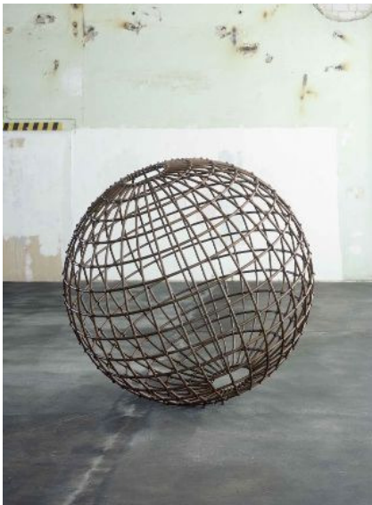
AdK_Hatoum_Globe Globe , 2007 Weichstahl, 170 cm Durchmesser Fotograf Holger Niehaus Courtesy Galerie Max Hetzler, Berlin © Mona Hatoum