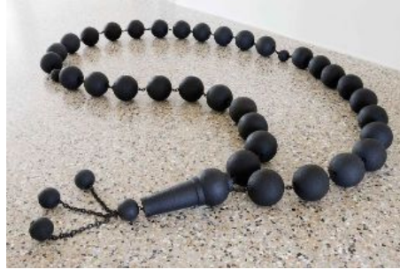
AdK_Hatoum_Beads Worry Beads , 2009 Patinierte Bronze, Weichstahl, variable Größe © Mona Hatoum