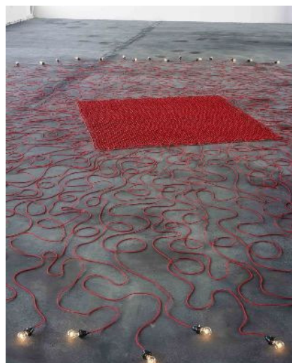
AdK_Hatoum_Undercurrent_detail Undercurrent (red) , 2008 Stoffbezogenes Kabel, Glühbirnen, Dimsteuerung, 8 x 1070 x 1070 cm © Mona Hatoum