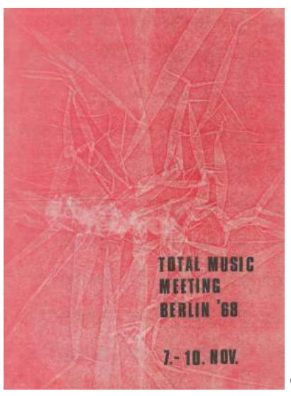
File: adk18_Underground_und_Improvisation_FMP_8 Poster Total Music Meeting 1968

Press images are provided free of charge solely for the current coverage of an exhibition. Credit lines must be cited in full. The images may neither be modified, cropped or overprinted. Any such changes to the images are only possible with prior permission in writing. Transfers to a third-party are not permitted. Press images are to be deleted from all online media four weeks after an exhibition has ended. Specimen copies are requested and should be sent unsolicited to the Press Office. For login details for downloads please contact +49 (0)30 200 57-1514 or send an e-mail to presse@adk.de .