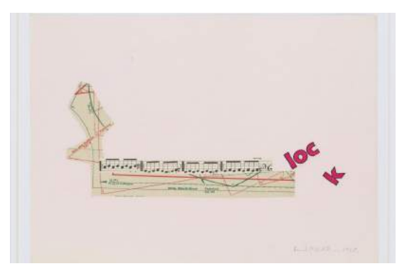
File: adk18_Underground_und_Improvisation_NftU_5 Katalin Ladik Loc k, 1978 © Katalin Ladik / Collection of Muzeum Sztuki, Łódź

Press images are provided free of charge solely for the current coverage of an exhibition. Credit lines must be cited in full. The images may neither be modified, cropped or overprinted. Any such changes to the images are only possible with prior permission in writing. Transfers to a third-party are not permitted. Press images are to be deleted from all online media four weeks after an exhibition has ended. Specimen copies are requested and should be sent unsolicited to the Press Office. For login details for downloads please contact +49 (0)30 200 57-1514 or send an e-mail to presse@adk.de .