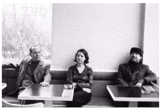
17 March 2018, Concert Barcelona Series & Rolfsson/Giesche/Sandell Barcelona Series