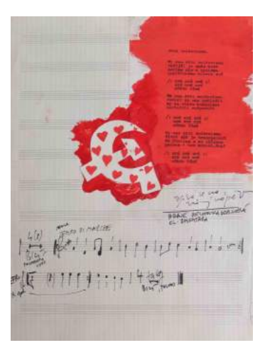
File: adk18_Underground_und_Improvisation_NftU_7 Milan Knížák

Score for Aktual band song 'Děti Bolševizmu' (Children of Bolshevism), 1968 © Milan Knížák / Collection of Muzeum Sztuki, Łódź, VG Bild-Kunst, Bonn 2018