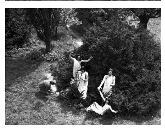
File: adk18_Underground_und_Improvisation_NftU_2 Jan Ságl The Plastic People of the Universe photographed in the grounds of the Břevnov Monastary, Prague, 1970