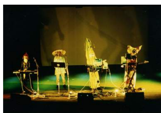
File: adk18_Underground_und_Improvisation_NftU_3 AG Geige at 3rd International Art Rock Festival, Convention Hall in Frankfurt am Main, 1 March 1991