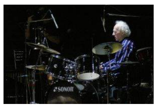
14 March 2018, Concert Vladimir Tarasov at the exhibition opening of "Underground and Improvisation" Vladimir Tarasov

Press images are provided free of charge solely for the current coverage of an exhibition. Credit lines must be cited in full. The images may neither be modified, cropped or overprinted. Any such changes to the images are only possible with prior permission in writing. Transfers to a third-party are not permitted. Press images are to be deleted from all online media four weeks after an exhibition has ended. Specimen copies are requested and should be sent unsolicited to the Press Office. For login details for downloads please contact +49 (0)30 200 57-1514 or send an e-mail to presse@adk.de .