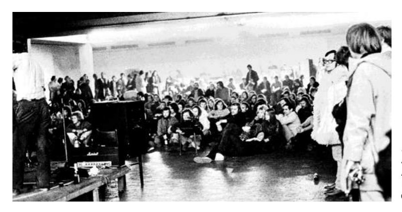
File: adk18_Underground_und_Improvisation_FMP_5 Audience at the workshop Freie Musik (Free Music), Akademie der Künste/Berlin, 1970

Press images are provided free of charge solely for the current coverage of an exhibition. Credit lines must be cited in full. The images may neither be modified, cropped or overprinted. Any such changes to the images are only possible with prior permission in writing. Transfers to a third-party are not permitted. Press images are to be deleted from all online media four weeks after an exhibition has ended. Specimen copies are requested and should be sent unsolicited to the Press Office. For login details for downloads please contact +49 (0)30 200 57-1514 or send an e-mail to presse@adk.de .