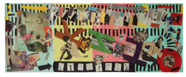
File: adk18_Underground_und_Improvisation_NftU_8 (E-E) Evgenij Kozlov KINO, 1985

Score for Aktual band song 'Děti Bolševizmu' (Children of Bolshevism), 1968 © Milan Knížák / Collection of Muzeum Sztuki, Łódź, VG Bild-Kunst, Bonn 2018