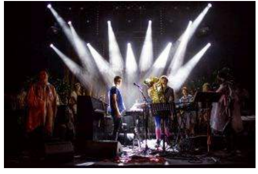
8 April 2018, Concert Speak Low, Trondheim Jazz Orchestra & Skrap Skrap and Trondheim Jazz Orchestra