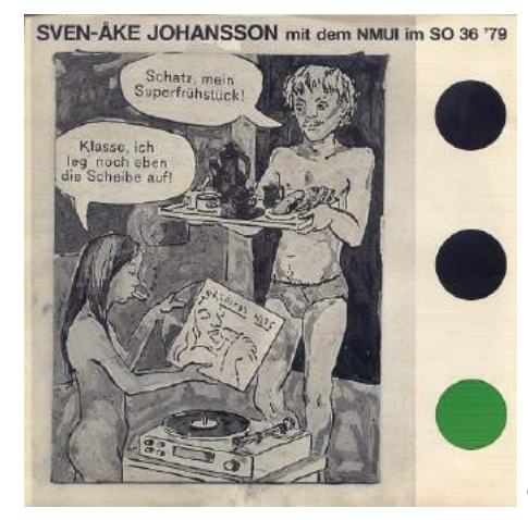
File: adk18_Underground_und_Improvisation_FMP_9 Sven-Åke Johansson mit dem NMUI Im SO 36, `79 Cover Single 7" FMP-S 17 Design: Martin Kippenberger