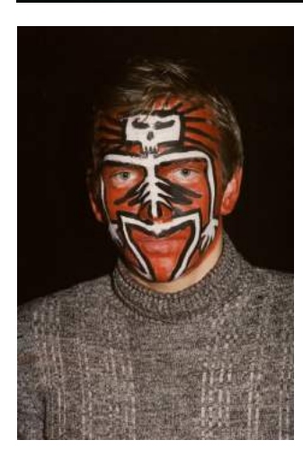
File: adk18_Underground_und_Improvisation_NftU_4 Wiktor Gutt & Waldemar Raniszewski Wyrazy na twarzy (Expressions on a Face), 1987 © Wiktor Gutt / Collection of Muzeum Sztuki, Łódź