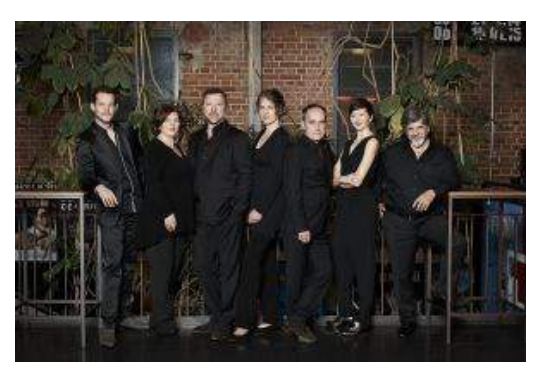
21 April 2018, Concert The Invention of Language Neue Vocalsolisten Stuttgart