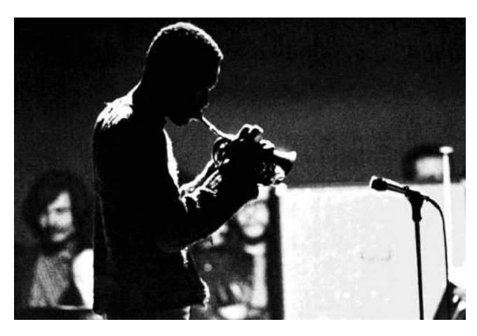
File: adk18_Underground_und_Improvisation_FMP_7 The Peter Brötzmann Group + Don Cherry at the workshop Freie Musik (Free Music), Akademie der Künste/Berlin, 1971