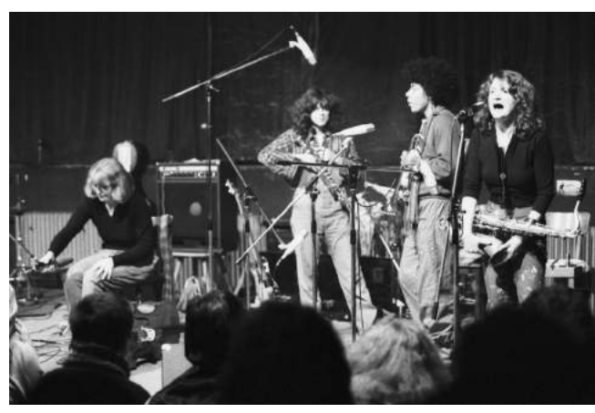
File: adk18_Underground_und_Improvisation_FMP_6 Feminist Improvising Group, FIG, at the Total Music Meeting, 1974