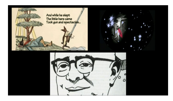
Alexander Kluge Still from the film triptych Es gibt kein richtiges Leben im falschen Hasen , 2019

Press images are provided free of charge solely for the current coverage of an exhibition. The images may neither be modified, cropped or overprinted. Any such changes to the images are only possible with prior permission in writing. Press images are to be deleted from all online media four weeks after an exhibition has ended. Use free-of-charge for the permanent promotion of the exhibition is possible. Further motives subject to charge upon request. For login details for downloads please contact +49 (0)30 200 57-1514 or send an e-mail to presse@adk.de .