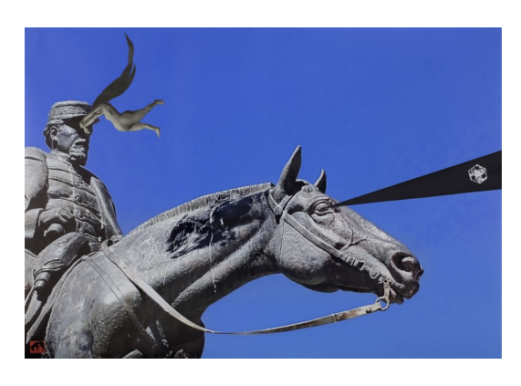
Eduardo Molinari The Evidence, 2021 © Eduardo Molinari / Archivo Caminante