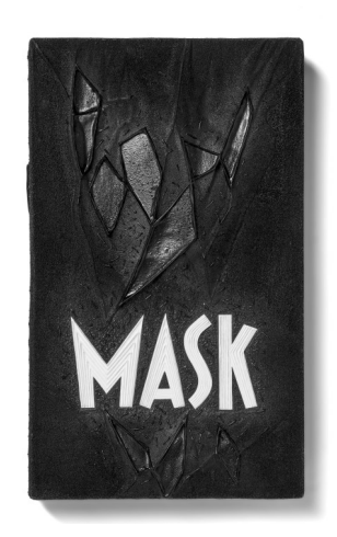
Candice Breitz Detail from Digest , 2020 1,001-Channel Video Installation: 200 wooden shelves, 1,001 videotapes in polypropylene sleeves, paper, acrylic paint, Shelves: 24.4 x 100 x 7.5 cm, Tapes: 20.3 x 12 x 2.7 cm The content carried on the concealed videocassettes will remain forever unrevealed. Unique Installation