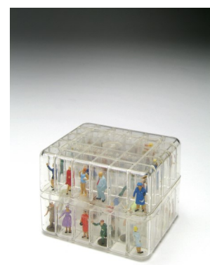
Walter Kempowski Model for Das Echolot. Ein kollektives Tagebuch , Munich 1993–2005 Kempowski Stiftung Haus Kreienhoop.