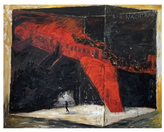
Erich Wonder NACHT(T)RAUM Acrylic on canvas © Erich Wonder