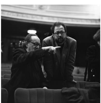
Heiner Müller with Erich Wonder during rehearsals for Hamlet/Maschine in the stalls of the Deutsches Theater Berlin, 1990