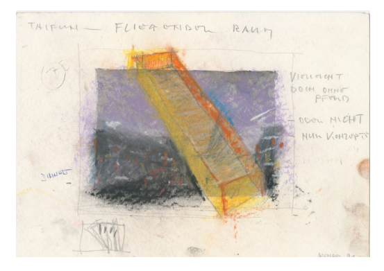
Erich Wonder Sketch for Das Auge des Taifun , Vienna, 1992 © Erich Wonder, Akademie der Künste, Berlin, Erich Wonder Archive

Press images are provided free of charge solely for the current coverage of an exhibition. The images may neither be modified, cropped or overprinted. Any such changes to the images are only possible with prior permission in writing. Press images are to be deleted from all online media four weeks after an exhibition has ended. Use free-of-charge for the permanent promotion of the exhibition is possible. Further motives subject to charge upon request. For login details for downloads please contact +49 (0)30 200 57-1514 or send an e-mail to presse@adk.de .